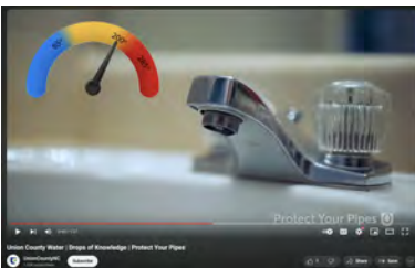
Protect Your Pipes Video