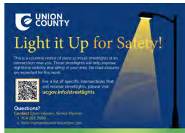
Light it Up for Safety Postcard